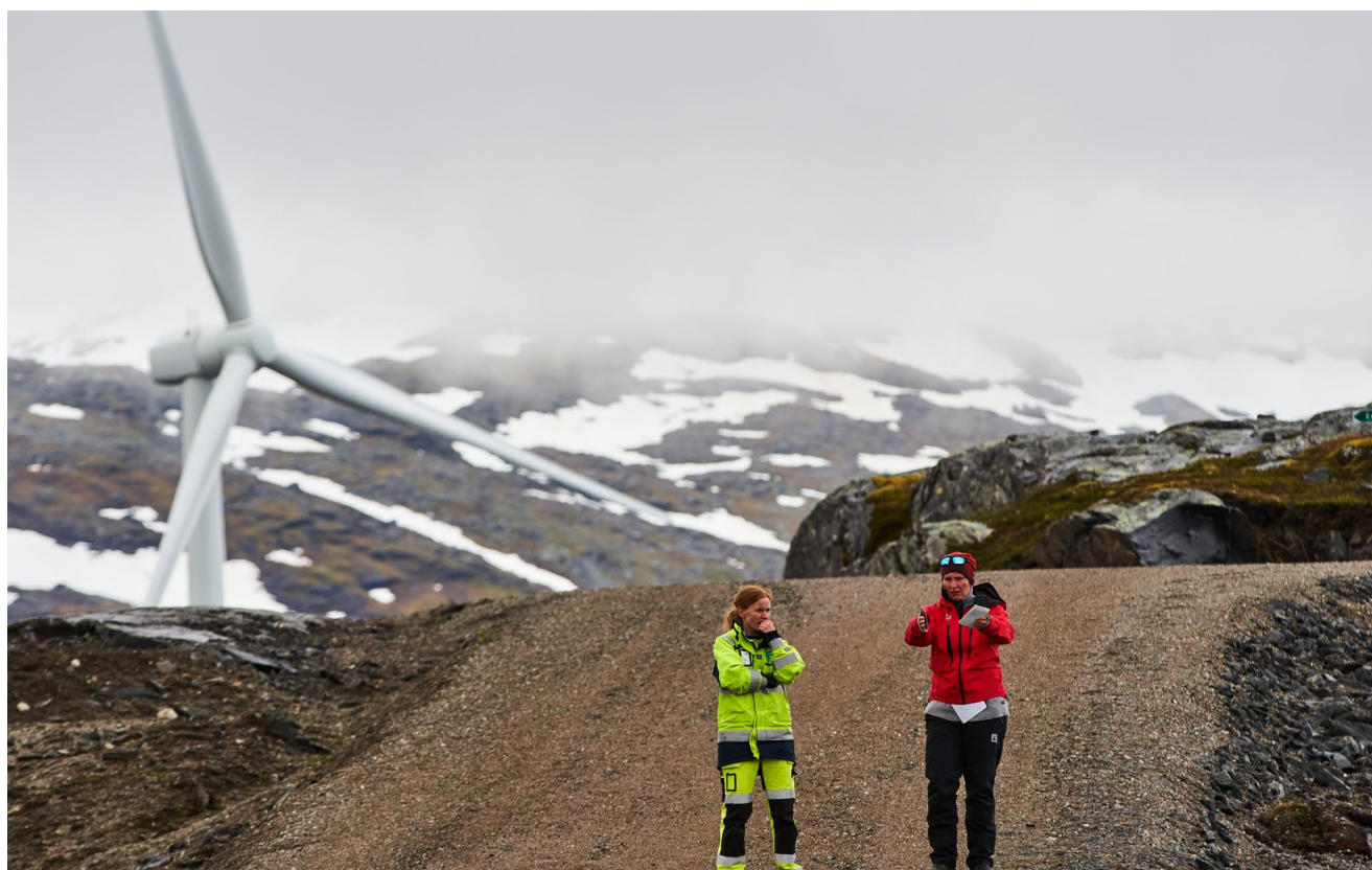
Sørfjord wind power plant #1.