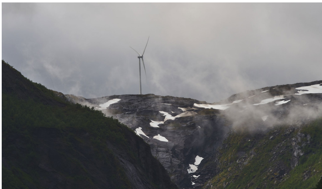
Sørfjord wind power plant #2.